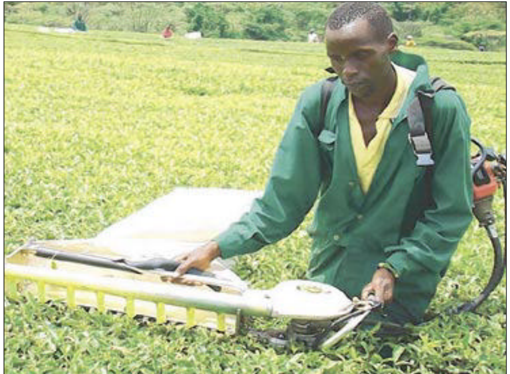
A man picks tea using the plucking machine. Tea pickers are opposed to the introduction of the machine.

He claimed some of the tea companies were sacking their permanent employees and later